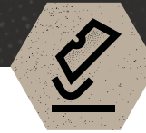
FLOOR- PROTECTIVE GUARD SYSTEM DESIGN