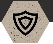
DUAL EDGE- GUARD SYSTEM

PDQ SIZE: 10.25" x 9" x 12" PART #: RBMCPDQ QTY: 12 Cutters / Box